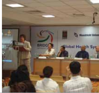
Bridging Different Worlds Symposium - Manipal, India