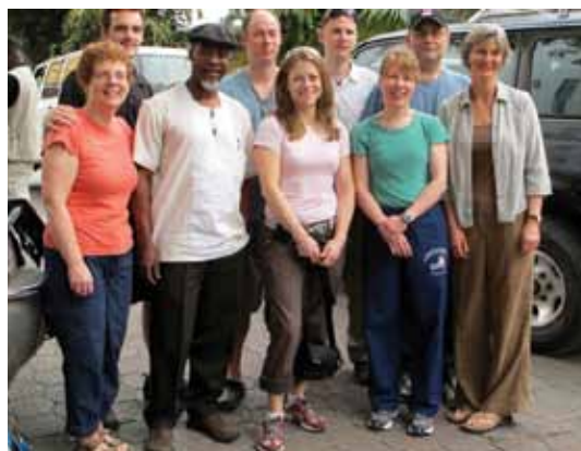
St. Joseph's International Outreach Program Surgical Team Oct, 2010