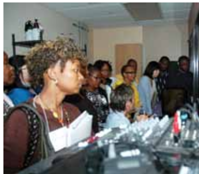
Summer Institute Simulation

This program implements community oriented, people-centered, interdisciplinary and PBL. This "McMaster Approach" is being adapted in whole or in part by many universities across the world. North West University held a PBL workshop highlighting what they had learned while sharing the "McMaster Approach" with representatives from three other South African Universities.