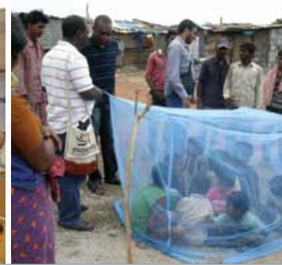
MSc Global Health students teaching community members how to use mosquito nets for malaria prevention