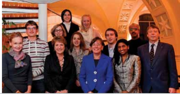
Global Health Advisory Board with Maastricht Students