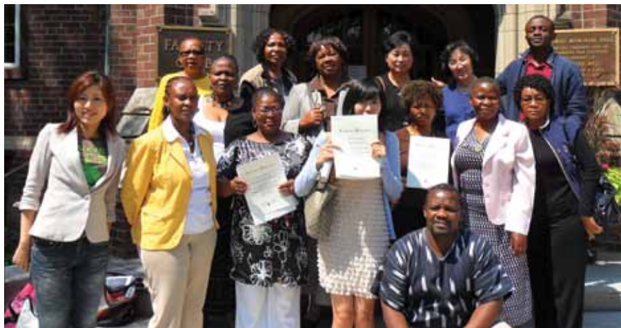
Summer Institute Group Closing 2010

A partnership program between McMaster University and North West University was solidified in 2009 and a Memorandum of