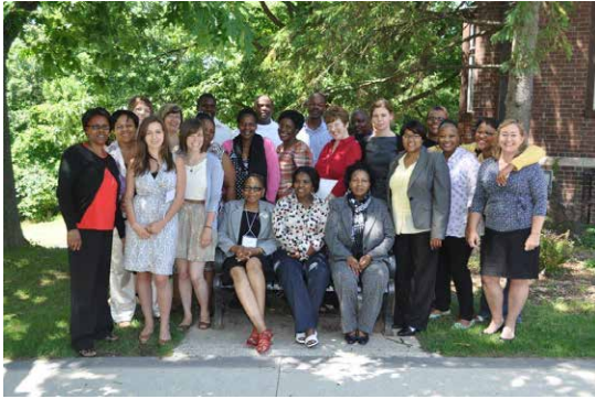
2012 Summer Institute Participants

The Global Health Office hosted McMaster University's 7th Annual International Interdisciplinary Summer Institute from June 18 through June 22, 2012. This year a total of 16 participants attended the program with attendees from University of Botswana, Botswana (1), University of Fort Hare, South Africa (5), and North West University, South Africa (10). The International Interdisciplinary Summer Institute is an interactive and practical approach to learning about Health Science education including how Problem Based Learning (PBL) is taught across the various health disciplines at McMaster. This week-long institute provides a unique and rich opportunity for knowledge exchange and transfer, where faculty members from other institutions can learn about educational methodologies, high-fidelity simulation, and faculty development. The Summer Institute is led by McMaster faculty experts in nursing, medicine, midwifery, rehabilitation sciences and information technology.