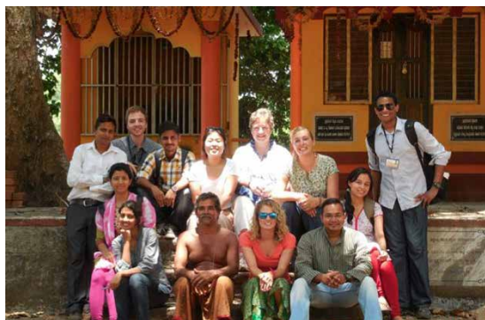
McMaster global health students near a 'snake temple' in India.

The partnership between McMaster University and Maastricht University has produced 122 graduates since its inception in 2010. Each year, there has been a considerable increase in the number of applicants to the program, with over 400 applications received for the 2012-2013 academic year. Domestic applicants were from across Canada, with the majority residing in Ontario. International applications were received from the United States, Philippines, China, Nigeria, Sierra Leone, Ghana, and Saudi Arabia. In 2012, there were 44 students enrolled in the MSc Global Health Program at McMaster and 50 students at Maastricht. During the second term, students have the opportunity to go on exchange to Maastricht University. In January 2012, ten McMaster students went on exchange to Maastricht and four Maastricht students came to McMaster.