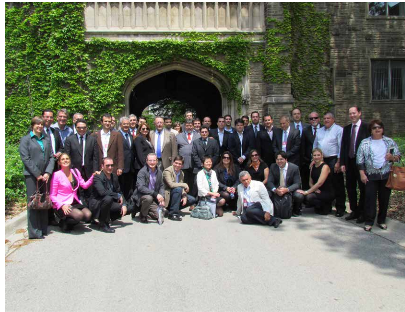
Delegates from the Higher Education Association of the State of São Paulo (SEMESP)