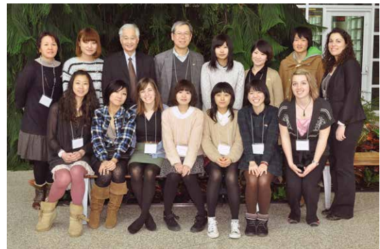
Niigata University Educational Seminar 2013

In March 2013, the Global Health Office, in collaboration with Mohawk College, hosted the fifth Niigata University Education Seminar. The 2013 visit was significant as it marked the return of the Niigata University Educational Seminar following the Great Sendai Earthquake in March 2011. This year, nine students (6 nursing and 3 medical laboratory) and two chaperone professors participated in the week-long seminar which ran from March 11 to March 18, 2013. The learning sessions consisted of lectures covering a wide range of topics including health-related programs in the Faculty of Health Sciences, Problem-Based Learning, the McMaster nursing curriculum, and research in education and practice. Japanese students had the opportunity to discuss topics with undergraduate and graduate McMaster nursing students. In addition, participants toured the Centre for Simulation Based Learning (CSBL); radiation therapy, radiography and ultrasound laboratories in the Institute of Applied Health Sciences; and the Michener Institute, Toronto. The Seminar concluded with presentations from the Niigata students, comparing health care education and delivery systems between McMaster University and Niigata University.