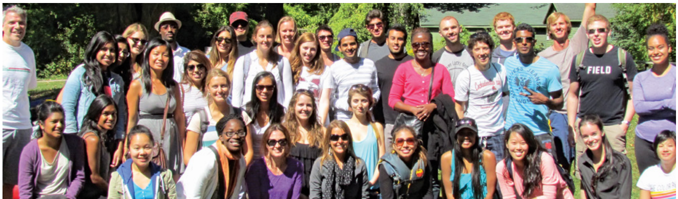
Global Health student orientation: Canoe trip down the Grand River, September 2013