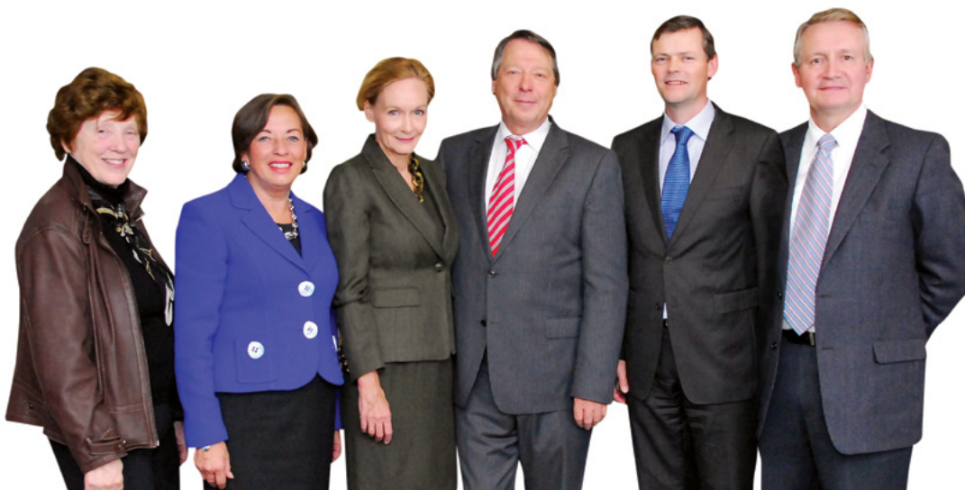
Members of the Global Health Advisory Board and faculty from McMaster and Maastricht Universities

The SAC was launched to provide an opportunity for MSc in Global Health students to advance their personal, professional and leadership skills. The SAC is comprised of current student volunteers who represent the program at public events. Students are engaged in activities throughout the year, including the Global Health Speaker Series and Advisory Board meetings.