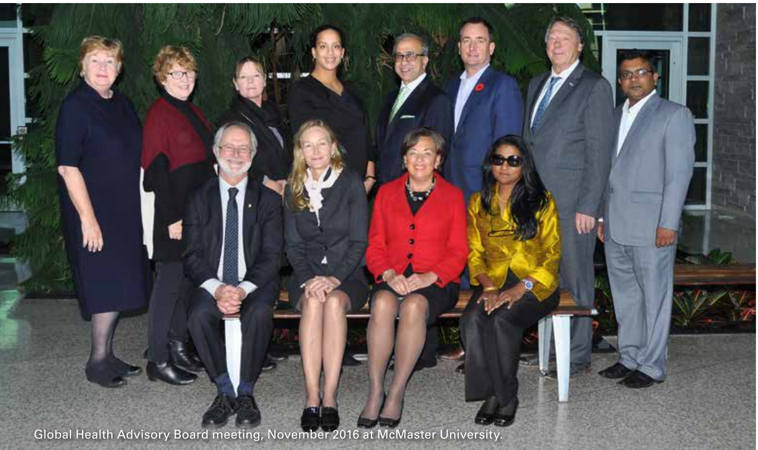
Global Health Advisory Board meeting, November 2016 at McMaster University.

The annual meeting took place in November 2016. The board met as a smaller group to discuss mission, vision and future strategies. In addition to the board members, faculty attended from McMaster, Maastricht, Manipal, and Norway.