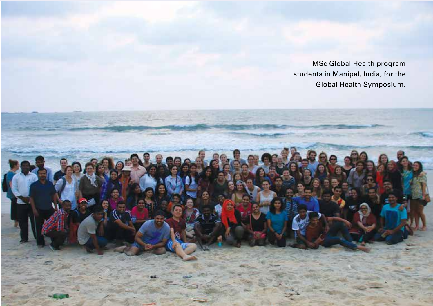
MSc Global Health program students in Manipal, India, for the Global Health Symposium.

Through our partnerships with institutions worldwide, we are committed to sharing knowledge, creating opportunities for exchange, and finding new and innovative solutions to critical global health problems.