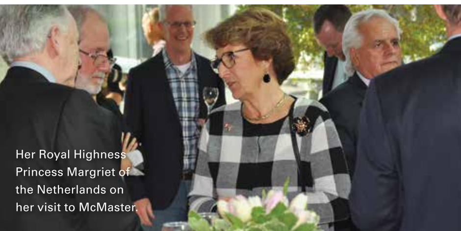
Her Royal Highness Princess Margriet of the Netherlands on her visit to McMaster.

The GHO consulted with both offices in preparation for students' attendance at the MSc GH program's Global Health Symposium in India. Seventy students from McMaster were able to attend the symposium.