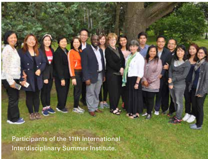
Participants of the 11th International Interdisciplinary Summer Institute.

This report highlighting student placements beyond Canada's borders details FHS contributions to the internationalization of higher education. Based on data collected and analyzed from October 2015-May 2016, the 2016 report includes: information on placements and electives provided by key stakeholders from each program; an overview of McMaster's risk management strategies; tools to help students, staff and faculty navigate risk management procedures during international placements. Future plans include an online tool to distribute the 2016 report.