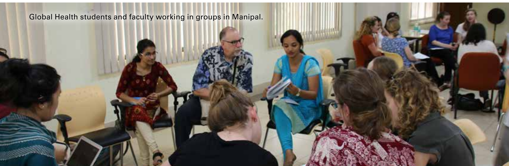
Global Health students and faculty working in groups in Manipal.

The High North course teaches future global healthcare leaders critical approaches to investigating policies from all points of view, while providing healthcare leaders located in the circumpolar north with easier access to higher education, and allowing for faculty and student exchanges.