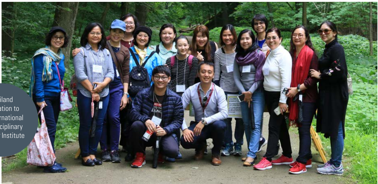
Thailand delegation to the International Interdisciplinary Summer Institute

Interdisciplinary Summer Institute. The two-week learning exchange took place June 16–30, 2018.