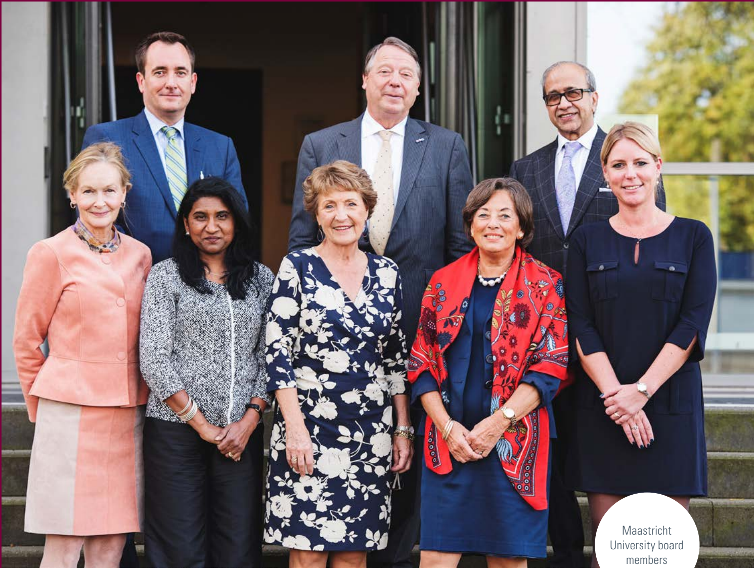
Maastricht University board members

The institutions within the consortium engage in ongoing collaboration and dialogue to identify the skills and knowledge students need to navigate the global health landscape—today and in the future.