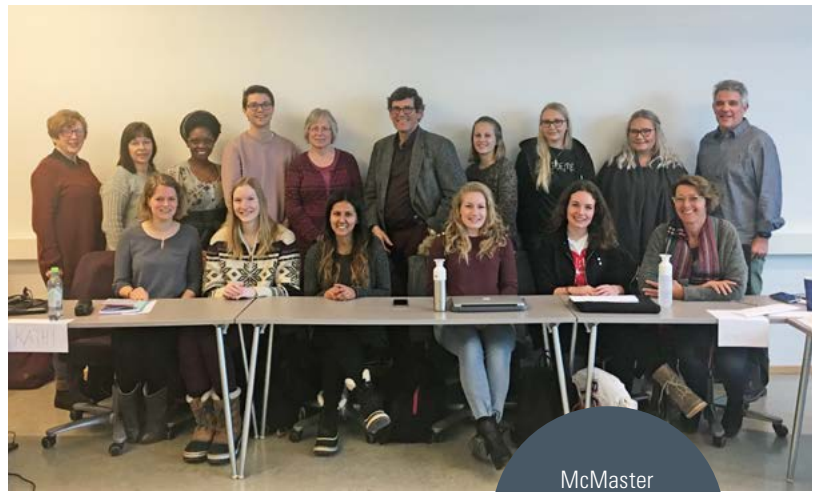
McMaster delegation to University of South-Eastern Norway